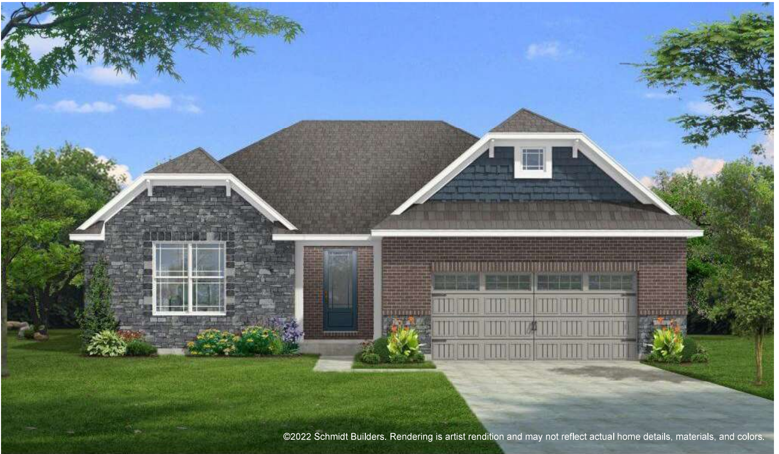
©2022 Schmidt Builders. Rendering is artist rendition and may not reflect actual home details, materials, and colors.