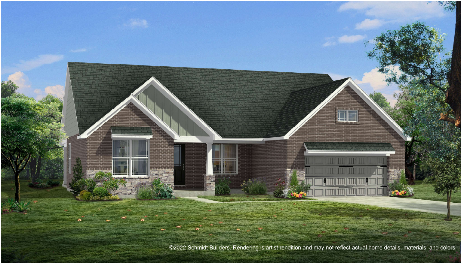
©2022 Schmidt Builders. Rendering is artist rendition and may not reflect actual home details, materials, and colors.