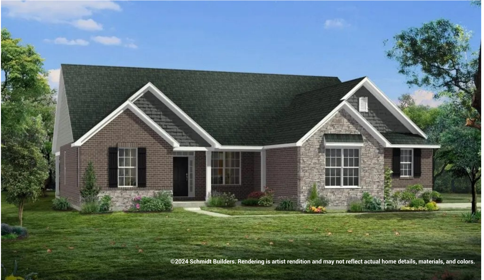
©2024 Schmidt Builders. Rendering is artist rendition and may not reflect actual home details, materials, and colors.