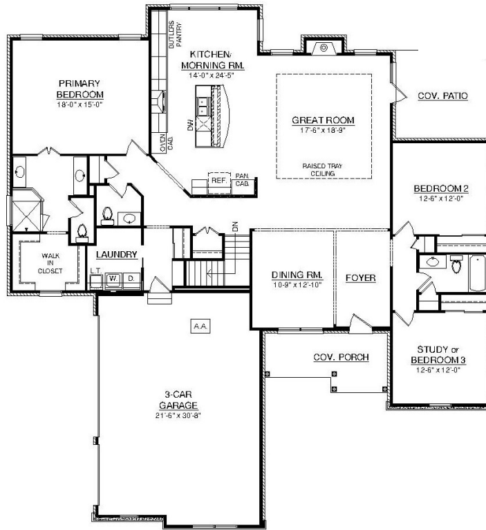
Main Level ©2024 Schmidt Builders