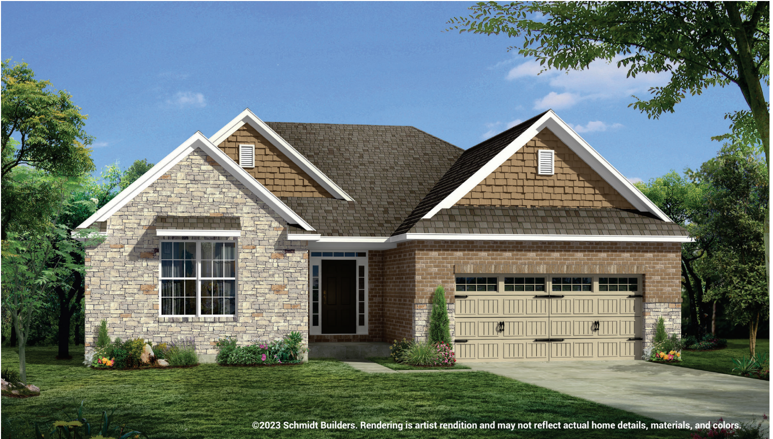
©2023 Schmidt Builders. Rendering is artist rendition and may not reflect actual home details, materials, and colors.