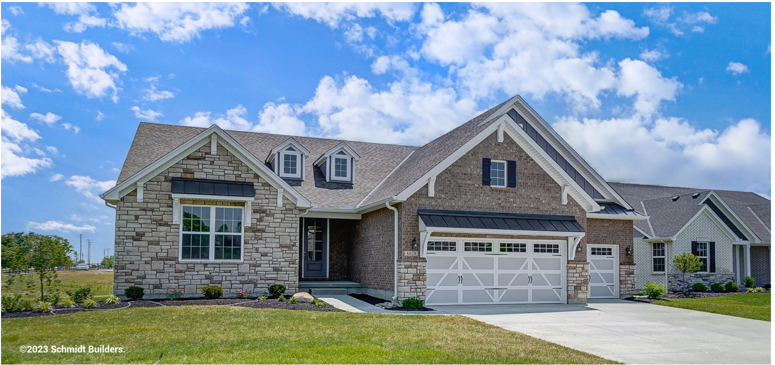
©2023 Schmidt Builders.