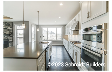
©2023 Schmidt Builders