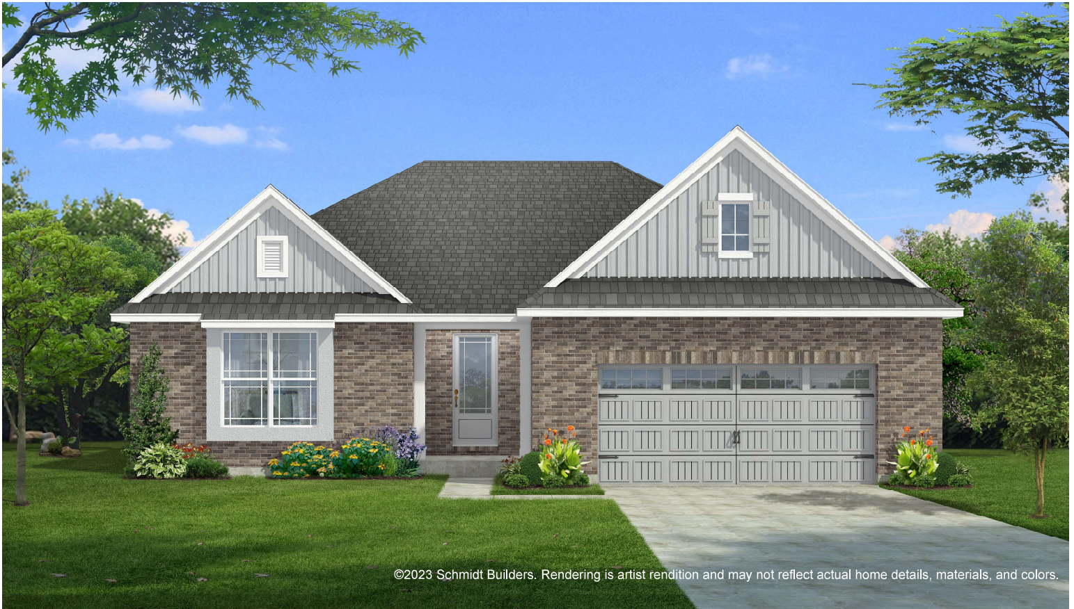
©2023 Schmidt Builders. Rendering is artist rendition and may not reflect actual home details, materials, and colors.