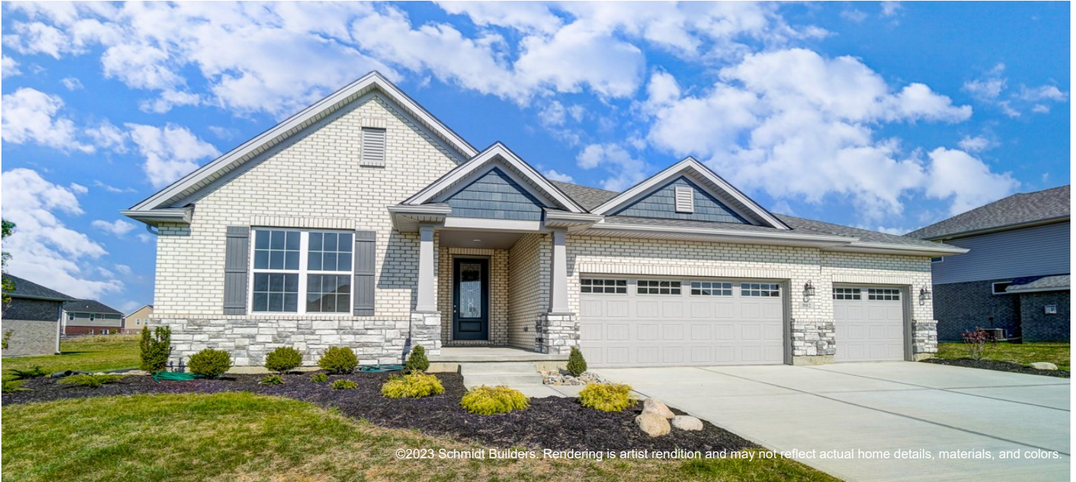
©2023 Schmidt Builders. Rendering is artist rendition and may not reflect actual home details, materials, and colors.