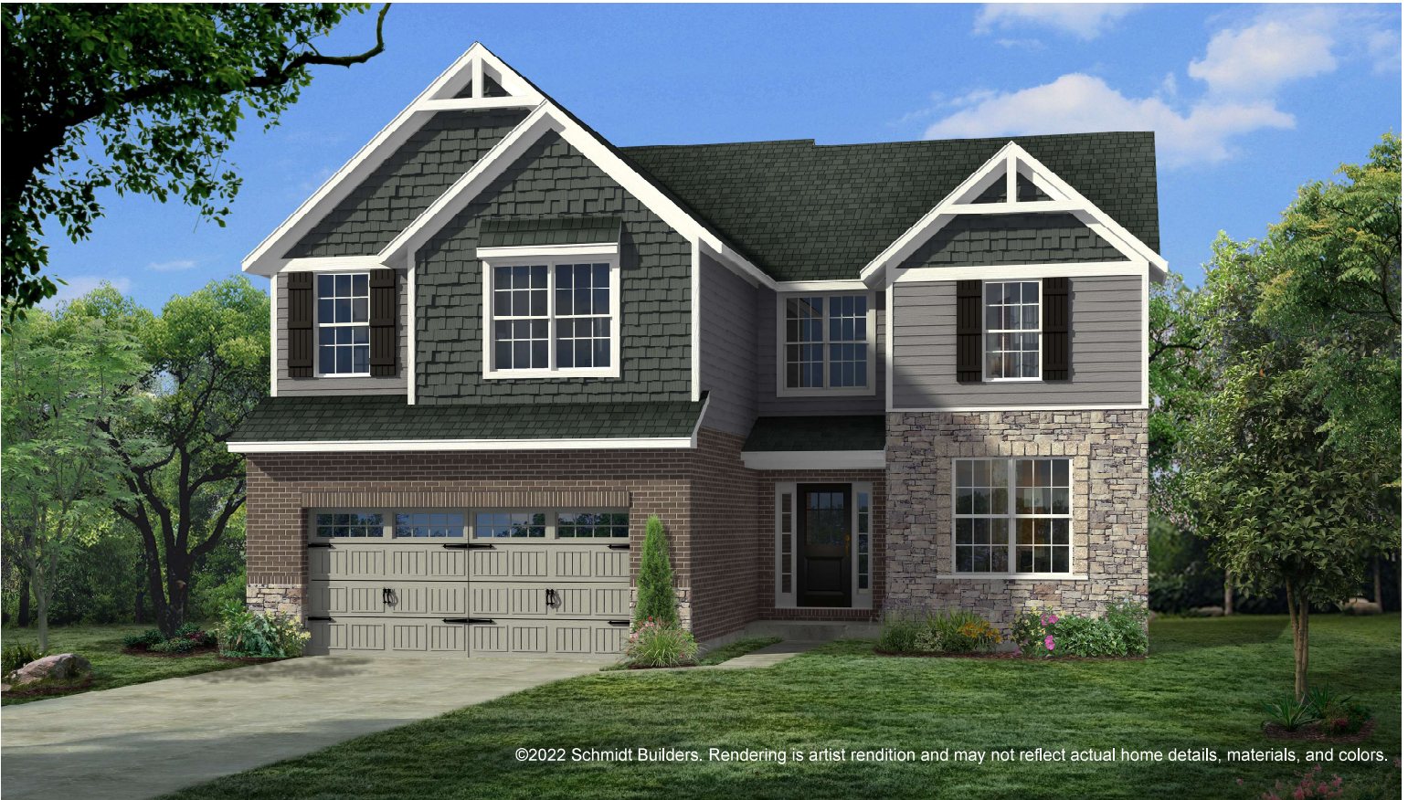
©2022 Schmidt Builders. Rendering is artist rendition and may not reflect actual home details, materials, and colors.