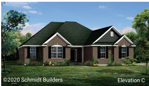
©2020 Schmidt Builders